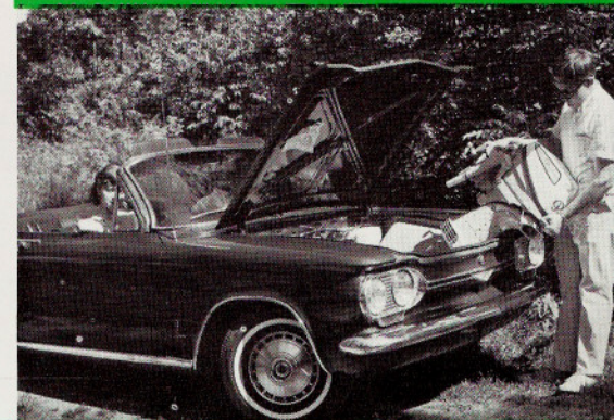
No need to leave anything at home to make room for this outboard motor. The OJ-200 is only 26" long, so it fits easily into the trunk of even a compact car, with room left for fishing tackle or camping gear. Only 58 lbs. total weight—it's easy packing from the car to the water, too.