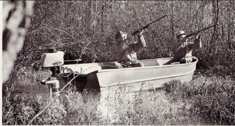
The Outboard Jet . . . the sportsman's taxi to the shallow inlets where the big fish are or to that remote duck blind . . . places where no propeller motor could take you.

Standard Equipment for the Outdoor Sportsman . . .